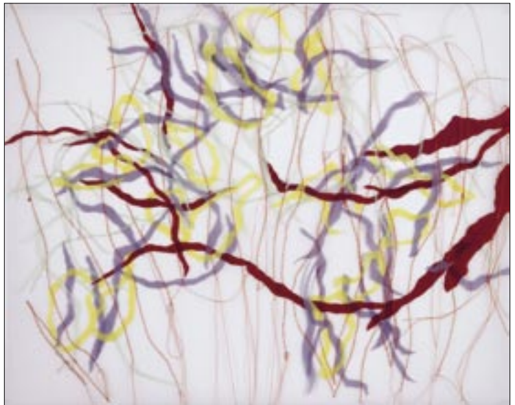
Figure 1 Synapse , 2006, vellum and thread, 11 in. × 14 in. [28 cm × 36 cm].

The title piece, Sensory Jetty (Figure 4), combines the formal characteristics and differences of these possible life forms. Individualized shapes are suspended over and submerged within watery planes of white vellum and blue vinyl to offer an imagined view into an entire ecological system. The acrylic rods used in Sensory Jetty pass through the wall that supports it. This wall