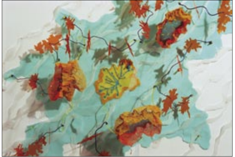
Figure 4 Sensory Jetty , detail, 2007, acrylic rods, vinyl, fabric, vellum, wire, and rubber, 74 in. × 75 in. × 28 in. (188 cm × 190.5 cm × 71 cm).

sits two feet in from, and parallel to, the wall that marks the exterior of the building. A window permits a view from the street below into the gallery and to the backside of Sensory Jetty . Daylight, passing through this window, flows across and passes through the acrylic rods to illuminate their tips on the other side. The tips create bright dots of neon green and yellow that echo light-emitting diodes (LEDs). Electrical impulses of the life actively inhabiting this world are made visible and the concept of the wall is changed from solid partition to “membrane.” 2 At night the piece is artificially lit from behind, which serves to maintain the LED effect. Inside the gallery, unless one ventures around to the two-foot space between the partition and window for a closer look, the permeability of the wall, the view from the street, and the exact source of the LED-like illumination carry on unnoticed.